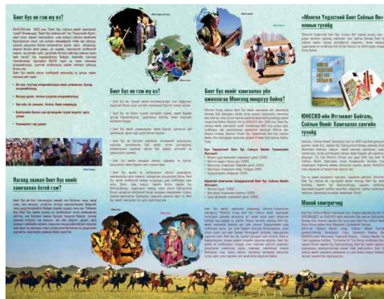
Brochure on the intangible cultural heritage (inner)